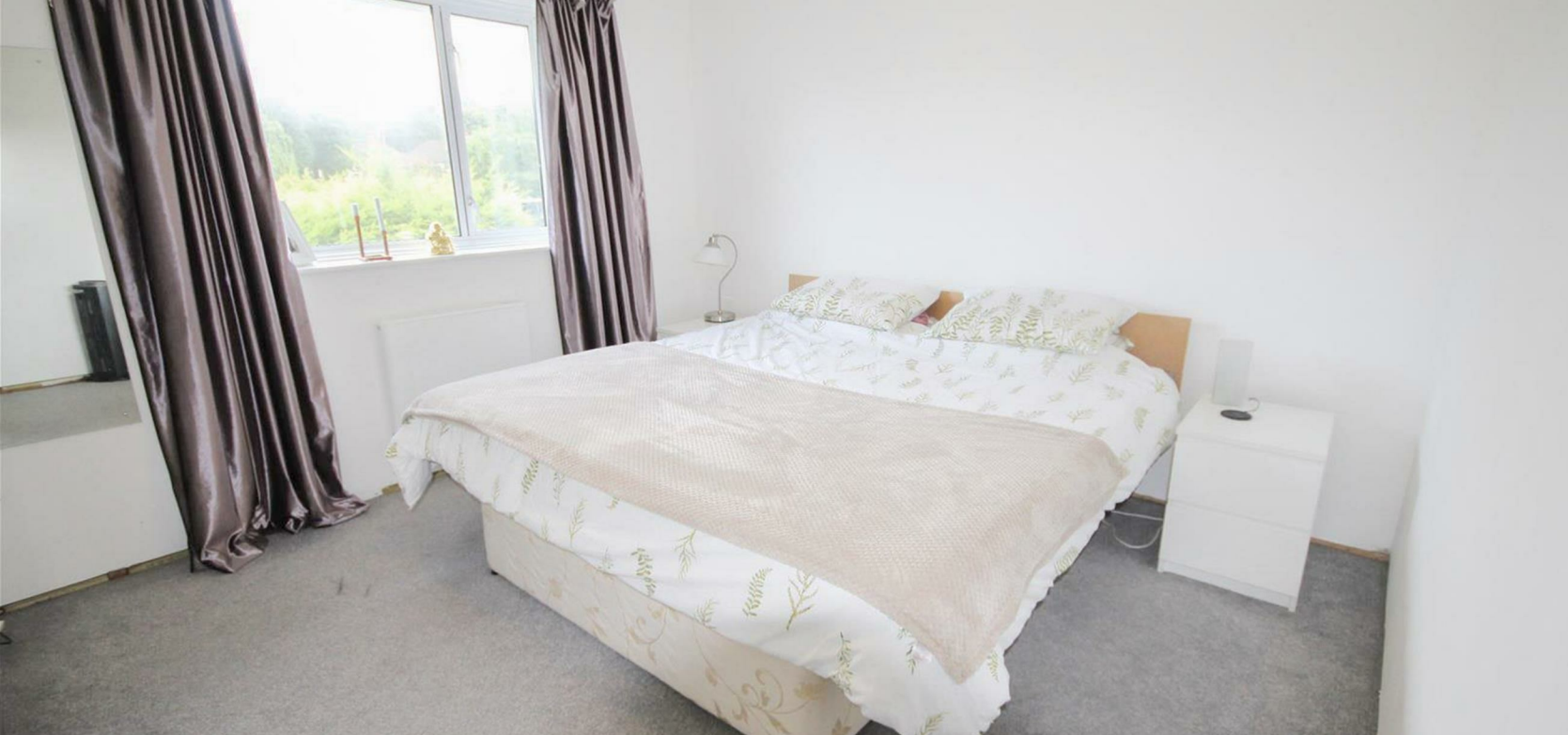
Bedroom Two 11'5" x 9'11" (3.48 x 3.02)